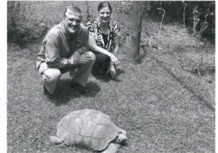
This tortoise is a frequent visitor to the backyard of our apartment on the seminary campus.

Read more about our work online: www.rockrohr.net