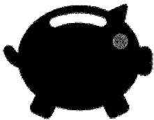
Checking/ Savings Accounts

Lutheran Federal Credit Union is designed with you in mind, with the added benefit of support for the LCMS community nationwide including church and school family members and employees.