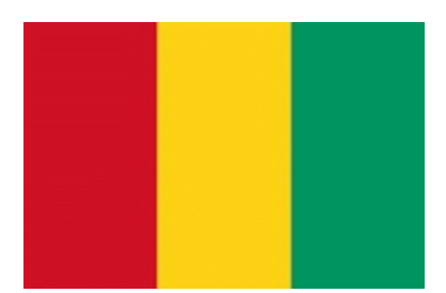
Flag of Guinea, red representing the blood of the martyrs who died from slavery and wars, yellow for the sun and natural riches of the land, and green for her vegetation.

there were times when people were forbidden from paying visits to their neighbors and friends so that the virus would be contained. With the history of this plague in mind, the church has doubled her efforts to proclaim the eternal salvation found only in Jesus Christ.